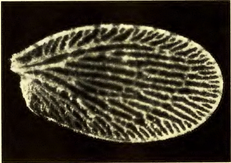
Fig. 2: Right forewing of paratype of Nusalala andinus , n. sp..

Antennae consisting of quadrate scape; elongate cylindrical pedicel; and 40–41 moniliform, yellowish-brown flagellomeres, which become somewhat darker apically. Compound eyes dark, rather small, approximately same diameter as length of gena between compound eyes and labrum.